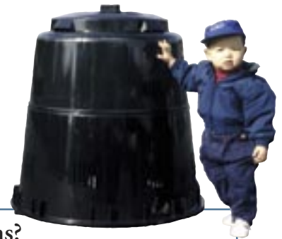
What can be put in home yard waste compost systems?

Use the chart below to avoid materials that may attract pests, create odors or cause other problems.