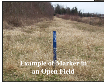
Example of Marker in an Open Field

Pipeline easements are identified with pipeline markers throughout the District. They serve as an important safety precaution for our customers. Typically, pipeline markers are found where a pipeline intersects a street, highway or traverse through open fields.